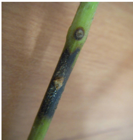
Fig 1. Symptoms of bacterial canker caused by Brenneria nigrifluens on walnut ( Juglans regia ) young twigs one month after inoculation.

the first time in the Alborz province with the typical lesions of shallow bark canker. The color of the trunks and branches ranged from brown to black with dark brown lesions that exuded a dark liquid through the cankers mainly in late summer. Some small pieces of the symptomatic tissue (the edge of healthy and affected tissues) collected were macerated in the Phosphate-buffered saline and streaked onto the Luria-Bertani medium (Atlas 2005). Plates were incubated at 27°C for 72 hours and prevalent colonies were purified on the Eosin methylene blue medium (Schaad et al. 2001). Ten Gram-negative and oxidase-negative strains, showing oxidative-fermentative positive metabolism, were selected for further characterization. Physiological and biochemical tests showed that the strains that grew at 36°C tested negative for the indole, arginine dihydrolase, and nitrate reduction and did not produce H 2 S from peptone. The strains did not induce a hypersensitive reaction on tobacco leaves but induced a hypersensitive reaction on geranium leaves after 24 hours; however, they did not hydrolyze gelatin and starch. The pathogenicity of the selected strains was confirmed by